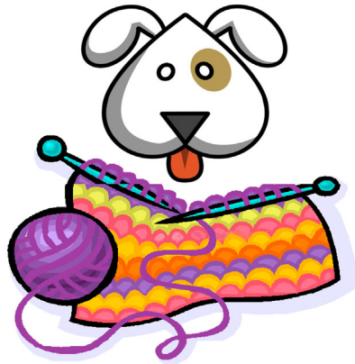
Purls & Pooches

While the heat has been an obstacle, the group is testing locations within the mall to find a shady space with good light that allows for easy conversation. Keep an eye on the Knerdy Knitters's web calendar at http://www.knerdyknitters.com/calendars.html or the guild's page at Meetup.com/Knerdy-Knitters-of-the-SFV for details.