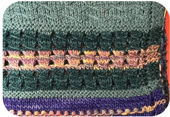
SEPTEMBER- OCTOBER BLOCK