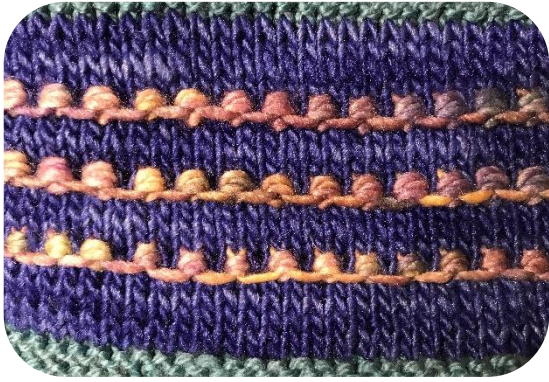
STRING OF PEARLS