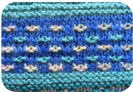
STEPPING STONES STITCH