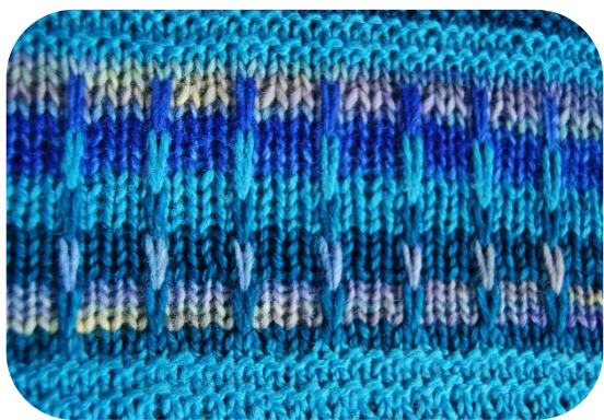
DOTTED STRIPES STITCH