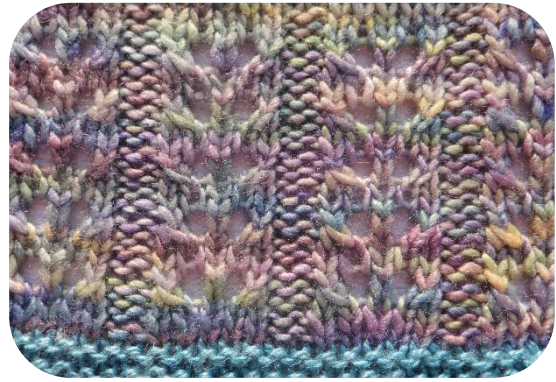
DOUBLE EYELET RIB